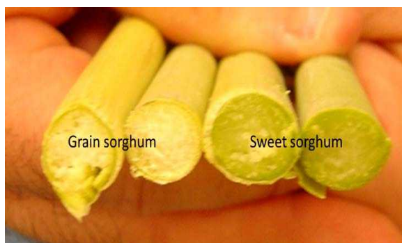
Fig. 1. Sweet sorghum growth and cane production (Dweikat et al., 2012)